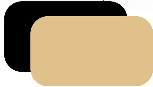
01 > 2" x 3 1/2"