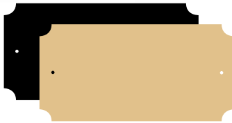
11 > 1 1/4" x 2 1/2"