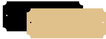
14 > 7/8" x 2 1/2"